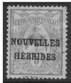
... and only a trace of "Condominium"