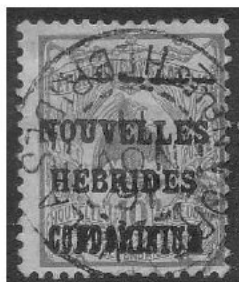
Extra 'lines' of overprint

The technical wizardry of Roland Klinger enables me to demonstrate the genuine overprint (the darker one) superimposed on top of the fake, to illustrate the heaviness of the fake.