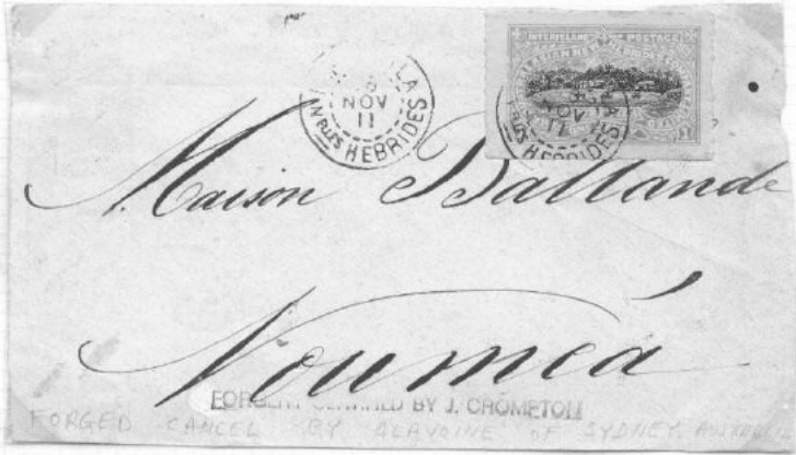
The ANHCo cover certified by Jim Crompton as a fake.