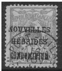
... and fake cancel...