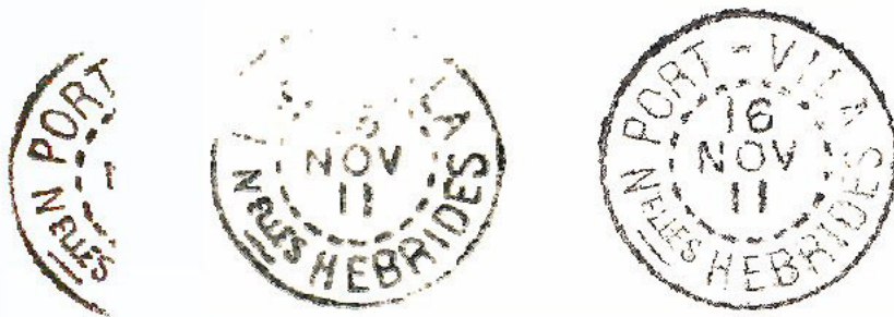
Examples of the Alavoine fake

The cancel he made is usually dated 16 November 1911, and it is easily recognised - particularly by the malformed "P" of "Port". Compared with the genuine strike of the same date, one can see: