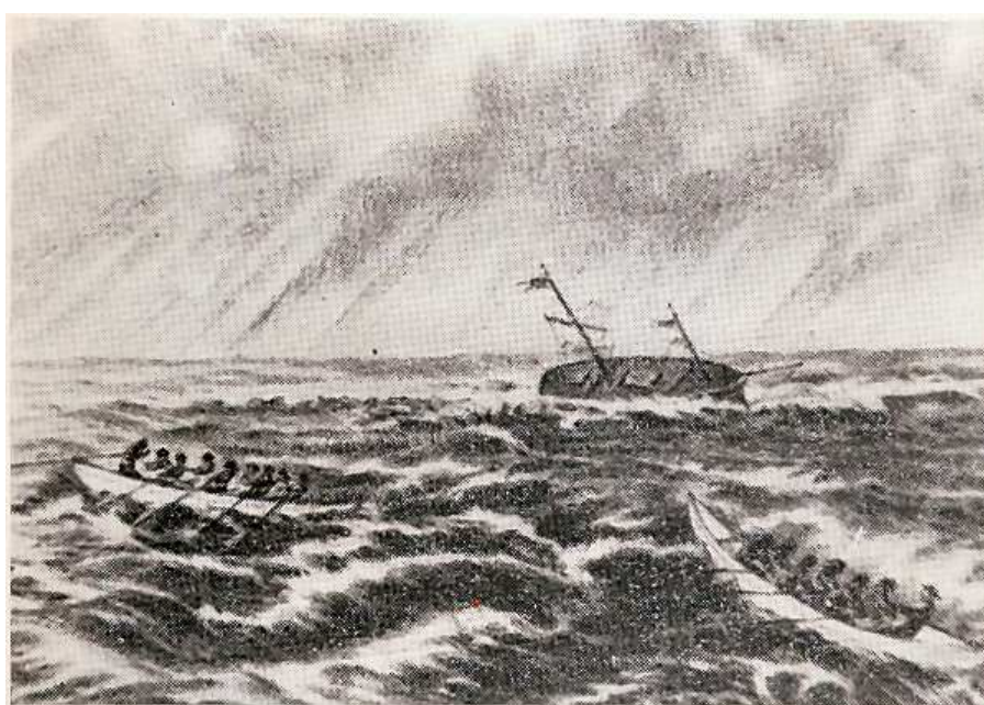
The wreck of the first "Dayspring" during a hurricane, Anelgauhat Harbour, Aneityum, 6 January 1873.